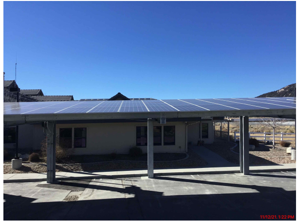
As Contracted Energy Last Month (kWh)